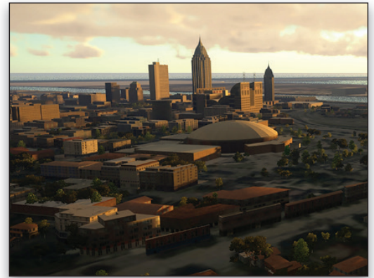
LiveCubes generated with Bentley LumenRT enlivened the project model with attention-grabbing visuals, providing interactive experiential viewing.

Animating the driving experience and aerial tour required considerable computer processing power. The driving animation contained 8,000 frames while the flying animation had 10,000 frames, both of which were rendered at high-definition 720p. The process to achieve a workable rendering configuration required numerous attempts, relying on trial and error using various programs and servers. Initially, the driving animation alone was estimated to take 47 days, running 24/7 to complete. Working with Bentley’s visualization team and using Bentley LumenRT, ALDOT was able to reduce that to seven days, reducing animation production time by almost 70 percent. “With Bentley LumenRT, we were able to quickly generate