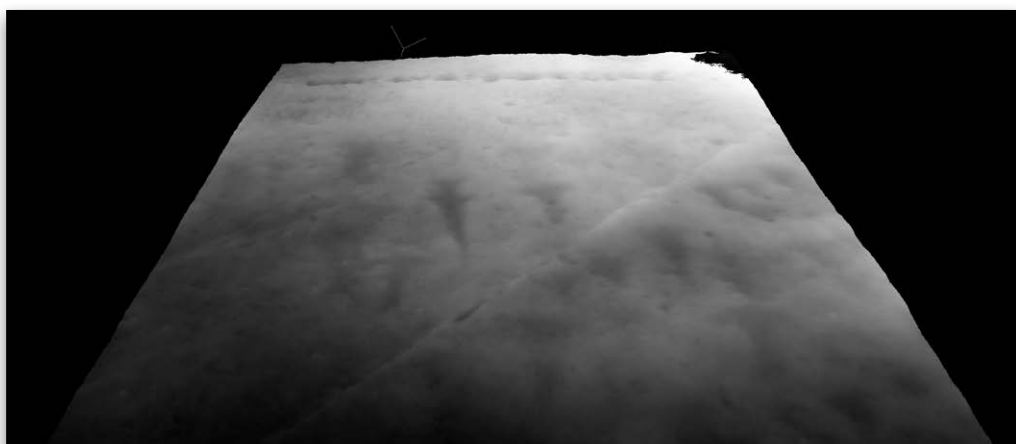
Range shade example.