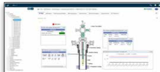
Fig. 1 – Each well can be monitored to analyze each component's performance and alert engineers to any possible issues via notifications.

Well integrity and flow assurance management involve a multidiscipline approach, requiring engineers to interact on a regular basis to assess the status of well barriers and safe operating envelopes, as well as manage risks associated with maintaining flow. The sheer number of associated risks