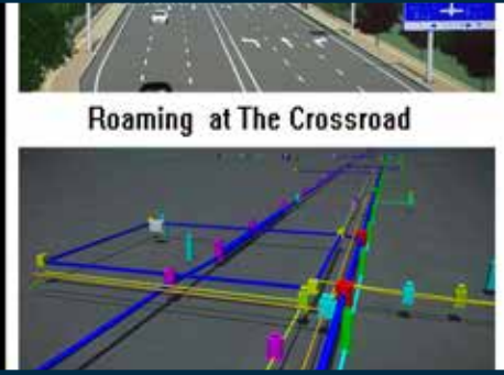
Roaming at The Crossroad