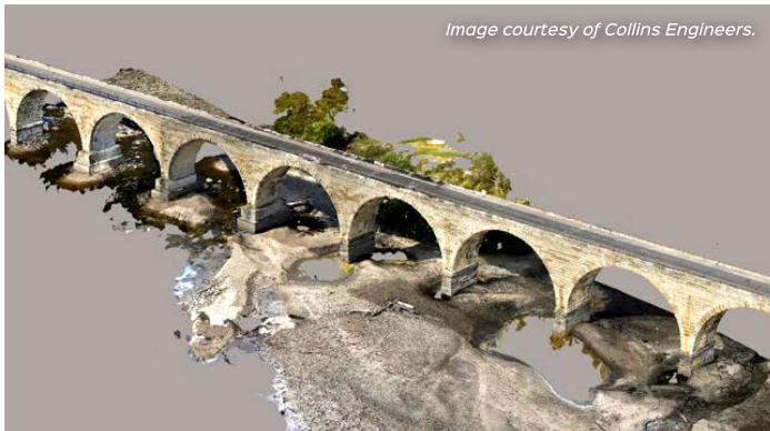
To preserve and improve the structural condition of an historical landmark, MnDOT initiated a USD 12 million rehabilitation of Minneapolis' 140-year-old Stone Arch Bridge.

access the digital twins via tablets and record their inspection information directly on the models. Traditionally, inspection notes were recorded and communicated using pencil and paper, accompanied by photos, that lacked the necessary detail to make definitive decisions that would help them both timely and safely complete the project. However, working with the 3D digital twin meant that the field team could inspect the bridge remotely, record their findings directly on it, and accurately pinpoint the areas in need of repair.