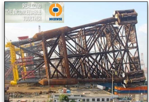
SHWE Jacket Load-out.

All in all, the combination of MicroStation and ProjectWise provided the information mobility solution that Dockwise required for such a large project executed on a global basis.