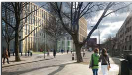
GenerativeComponents allowed PLP to test up to 100 options.

Critically, this activity was not limited to closed meetings within the architectural offices but also played a fundamental role as a presentation tool in discussions with city planners and the team of consultant engineers to meet the project’s environmental criteria.