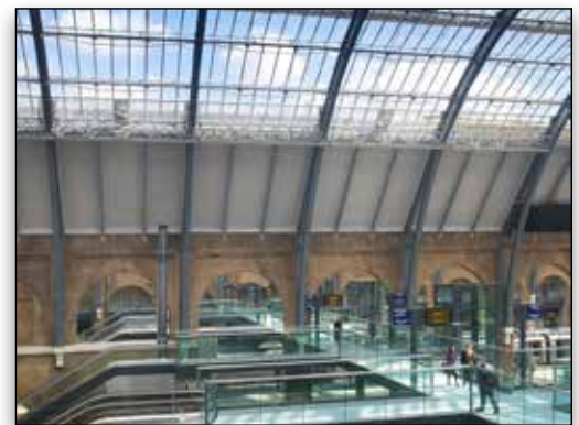
Lifelike rendering of the project helped clearly communicate design intent with stakeholders.

The station remodel has enhanced passenger amenities, rationalized operational activities, and significantly increased retail space. In addition, John McAslan + Partners played a key role in the wider transformation of the King's Cross area. This included improved infrastructure, social, and commercial changes that now connect the station with the substantial King's Cross Central scheme to the north, as well as improved interchange links with the London Underground, St. Pancras station, Thameslink services, taxis, and buses.