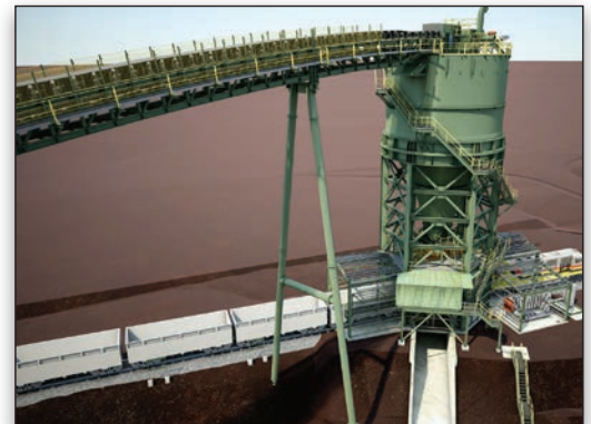
This image shows Brockman Syncline No. 4 Project-Rendering with ProSteel structural members.

The project was primarily modeled in Bentley's ProSteel software. The software is ideally suited to tasks such as laying out complex structures, producing shop drawings, assembling all connections, and managing bills of material. ProSteel increases productivity by providing the automatic creation of documentation and details. PDC used the software to model