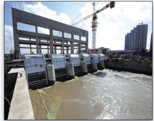
The final pump construction used three pit tubular pumps capable of discharging 20 cubic meters per second.

With digital designs accessible through ProjectWise, the Institute’s construction teams could use technologies like Bentley Map® Mobile to review the latest 3D drawings while in the field. The final pump construction, which was completed and ready to pump water on July 30, 2014, used three pit tubular pumps capable of discharging 20 cubic meters per second. As part of the asset handoff to the