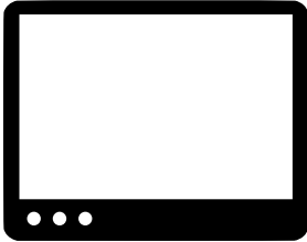
RAIL PREDICTIVE MAINTENANCE