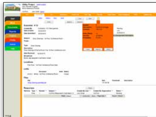
ProjectWise Construction Management's submittal module with an open risk item.