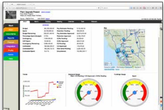
ProjectWise Construction Management's project-level dashboard.

ProjectWise Construction Management lets you manage contracts, finances, and risk exposure at the project, program, or portfolio level. This is a powerful capability for construction managers and owner-operators that need to manage multiple projects and diverse funding sources.