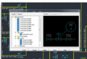
Create assemblies of common components groups.

AutoPLANT P&ID V8i employs the piping design hierarchy of Process Lines comprising of one or more pipe runs. Pipe runs have a single size, set of specifications, source and destination. Process lines are made up of one or more pipe runs and have nominal values for size and spec. The Process Line Manager tool manages process lines and pipe runs on the P&ID to more easily manage the design of entire runs.