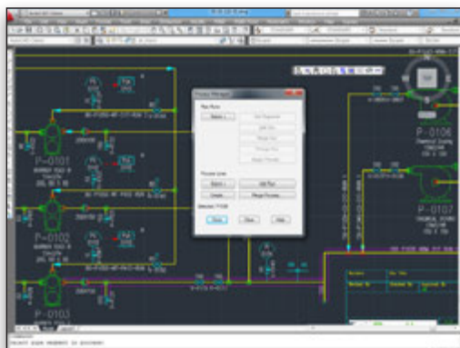
Manage piping design with the Process Line Manager.