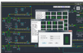
Advanced parametric drafting routines speed drawing generation.

AutoPLANT® P&ID V8i provides an indispensable tool for creating intelligent process and instrumentation diagrams. Using AutoCAD as the drafting engine—linked dynamically to an external database—engineers can quickly and accurately build a project repository for tagged components and related properties.