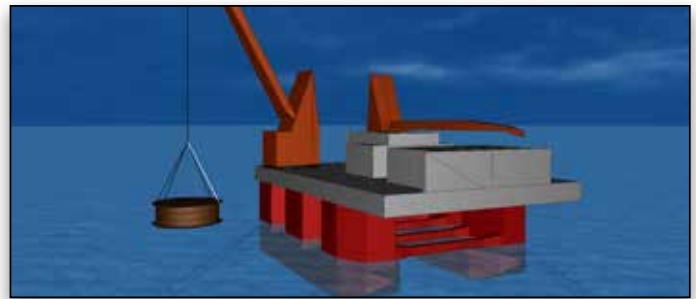
MOSES can compute motions and stability of any vessel or platform.

Connectors in MOSES are particularly flexible and effective. They provide a generalized way of describing connections between floating bodies, or to the ground, and include catenary