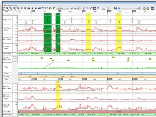
Manage rail asset information.