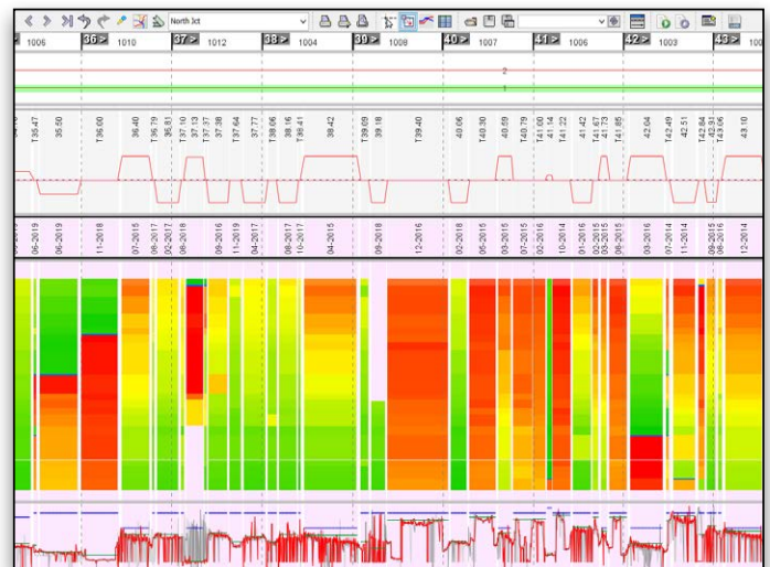
Analyze rail condition history and forecast rail maintenance.

Data visualization is critical in transforming vast quantities of complex linear data into actionable information that users can readily access, understand, and utilize. Straight line diagram visualization features provide you with instant access to an informative representation of any combination of configured data types at any location on the railroad network.