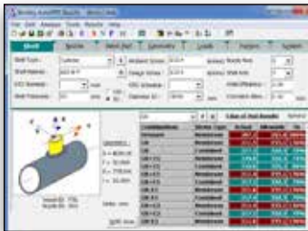
The Bentley AutoPIPE Nozzle interface allows data to be added on one screen.

Bentley® AutoPIPE® Nozzle is a stand-alone engineering application that also fully integrates with AutoPIPE for calculating local stresses at nozzle/vessel junctions, trunnion attachment points, clip connections, and lug attachments on the vessel shell. Based on well-known engineering design standards, AutoPIPE Nozzle helps engineers and designers quickly determine whether or not the wall of a pressure vessel, exchanger or tank can withstand piping loads on the nozzle or at clip and lug connections.