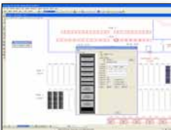
Rack Manager allows placement and configuration of equipment.