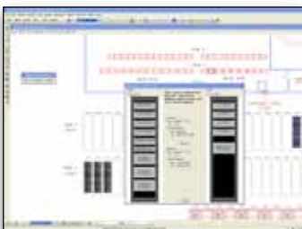
Connect equipment according to specified connection rules.