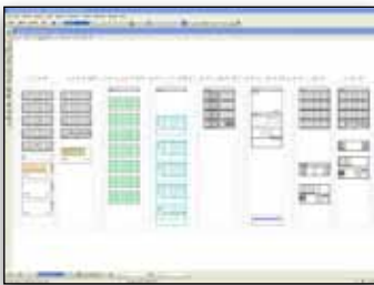
Front rack elevation view created in Bentley Inside Plant.

Bentley Inside Plant can generate several time-saving reports. The Equipment Specifications Report provides details of equipment used in the design. The Bill of Materials Report includes all racks, equipment, and associated costs. The Connection Report displays the port level connections of the selected equipment. Wire Run and Circuit Trace Reports and logical schematic drawings are automatically created.