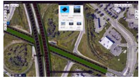
Road design leveraging a reality mesh in Bentley's OpenRoads ConceptStation.