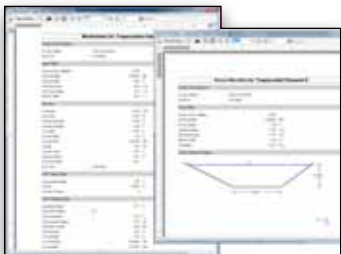
Manage data easily using the Project Explorer and engineering libraries