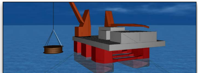
MOSES can compute motions and stability of any vessel or platform.

All three packages include the MOSES Solver and MOSES Language modules – the platform on which all analysis capabilities depend. The unique, generalized solver allows the consideration of all types of forces acting on the floating system, including hydrostatic, hydrodynamic, inertial,