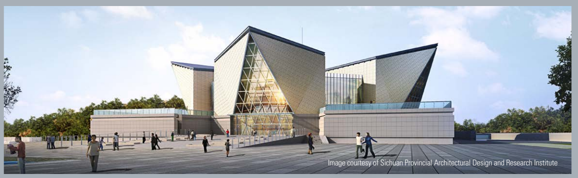
Image courtesy of Sichuan Provincial Architectural Design and Research Institute