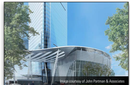
OpenBuildings Designer was used on this mixed-use office and hotel with boutique retail.

For additional information, and to read about the extraordinary projects designed using OpenBuildings Designer, visit https://www.bentley.com/openbuildings-designer/