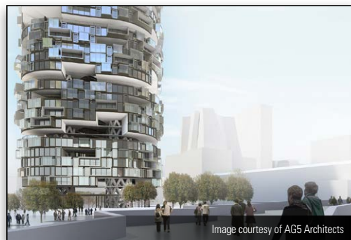
OpenBuildings Designer was used to design this multi-use residential tower.