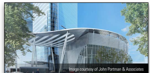
OpenBuildings Designer was used on this mixed-use office and hotel with boutique retail.

For additional information, and to read about the extraordinary projects designed using OpenBuildings Designer, visit https://www.bentley.com/openbuildings-designer/