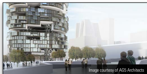
OpenBuildings Designer was used to design this multi-use residential tower.