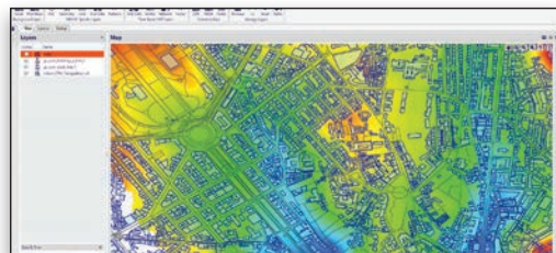
The figure shows a screenshot of OpenFlows FLOOD map engine during the implementation of an urban flood model.