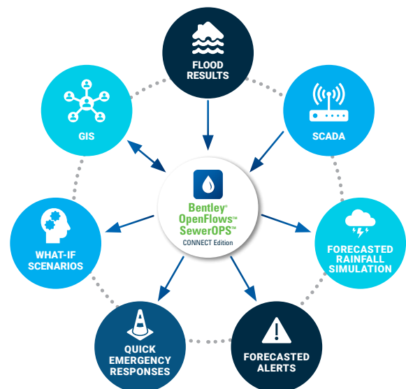
OpenFlows SewerOPS supports wastewater digital twins.

In addition to improving efficiency, OpenFlows SewerOPS delivers key user interface enhancements that boost system performance. These capabilities include enhanced menus, toolbars, and workspaces that allow operators to launch multiple simulation runs, even while other users are reviewing or editing. The software enables users to model, monitor, and forecast effectively.