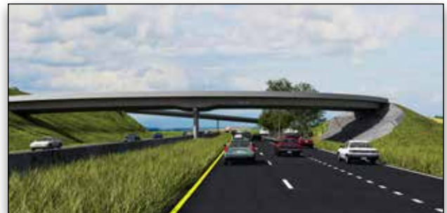
InRoads allows design-time visualization within the workflow eliminating the need for additional staff and visualization software.