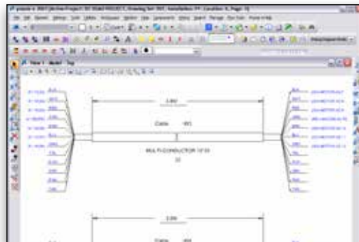
The cable diagrams in Promis.e display up-to-date connection information.