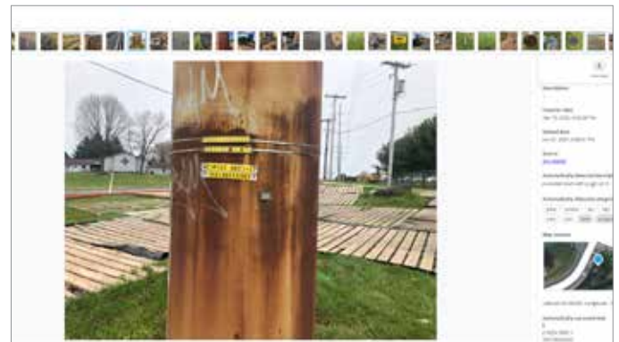
Easily search through your entire photo collection with AI-powered indexing tools.

Have the freedom to store data wherever you choose while maintaining a single interface and security model of all connected repositories. Store data as a digital construction model (iTwin ® ), which is accessible via cloud services and has the structure needed for construction, such as location, work, and organization breakdown structures.