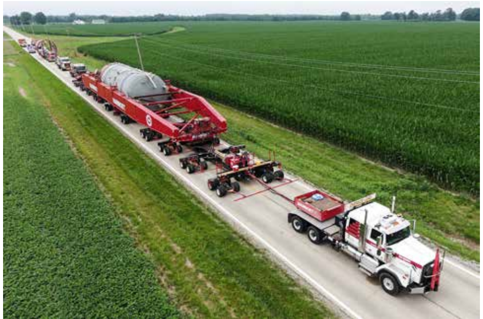
Illinois DOT used the Illinois Transportation Automated Permits (ITAP) system to manage the routing and bridge analysis for an oversized load, weighing nearly 900,000 lbs., moving from Tulsa, Oklahoma to Robinson, Illinois.

For example, Illinois DOT utilized bridge analysis software to analyze all the roadway structures on the route chosen by the Illinois Transportation Automated Permits (ITAP) system to determine if the infrastructure around the route could support the weight and size dimensions of the truck's load. Bridge clearances, live-load analyses, and temporary restrictions were all considered to determine the feasibility of the route. Structure ratings were applied to each structure based on the load's characteristics and the structure's features and if the structures could not support the weight or were too small for the load's measurements, another route was determined. If no failed structures were found, a permit was automatically issued.