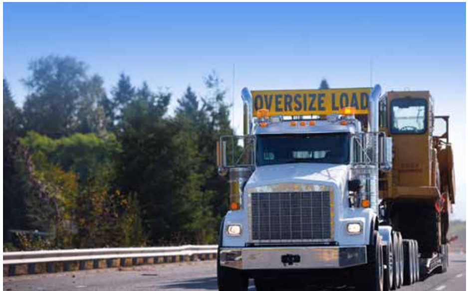
A tractor-trailer moving an oversize load on a state highway requires an OS/OW permit and routing.

Over-the-road trucking is an important component of the transportation system in North America. It requires over 3.6 million heavy-duty Class 8 trucks, more than 3.5 million truck drivers, and nearly 39 billion gallons of diesel fuel to move all that freight across the continent. The economy depends on trucks to deliver nearly 70 percent of all annually transported freight in the U.S. and Canada, accounting for USD 671 billion worth of manufactured and retail goods transported by truck in the U.S. and another USD 295 billion in trade with Canada. Trucks move more than 10.5 billion tons of freight per year, and approximately 5 percent of that tonnage was oversized/overweight loads.